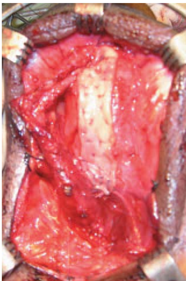
Figure 3. Dorsal only buccal mucosal grafting in bulbar urethra.

17 to 81 years) and they had been followed up for a mean of 32 months (range, 25 to 51 months). There were no significant differences in the two groups and their subgroups in terms of mean patients' age, mean stricture length, or etiology. Total success rates of dorsal and ventral anterior OMG urethroplasty were 83.3% and 75.8%, respectively ( P = .5 ). Early complications of oral graft harvesting consisted of cheek swelling and perioral numbness in 4 (7.5%) patients, with spontaneous resolution.