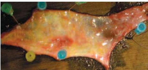
Figure 1. Buccal graft harvesting and trimming.

In ventral BMG technique, graft was sutured to the urethral plate using 5-0 vicryl sutures. Thereafter, the graft was covered by dartos fascia in the penile group or spongiosum tissue